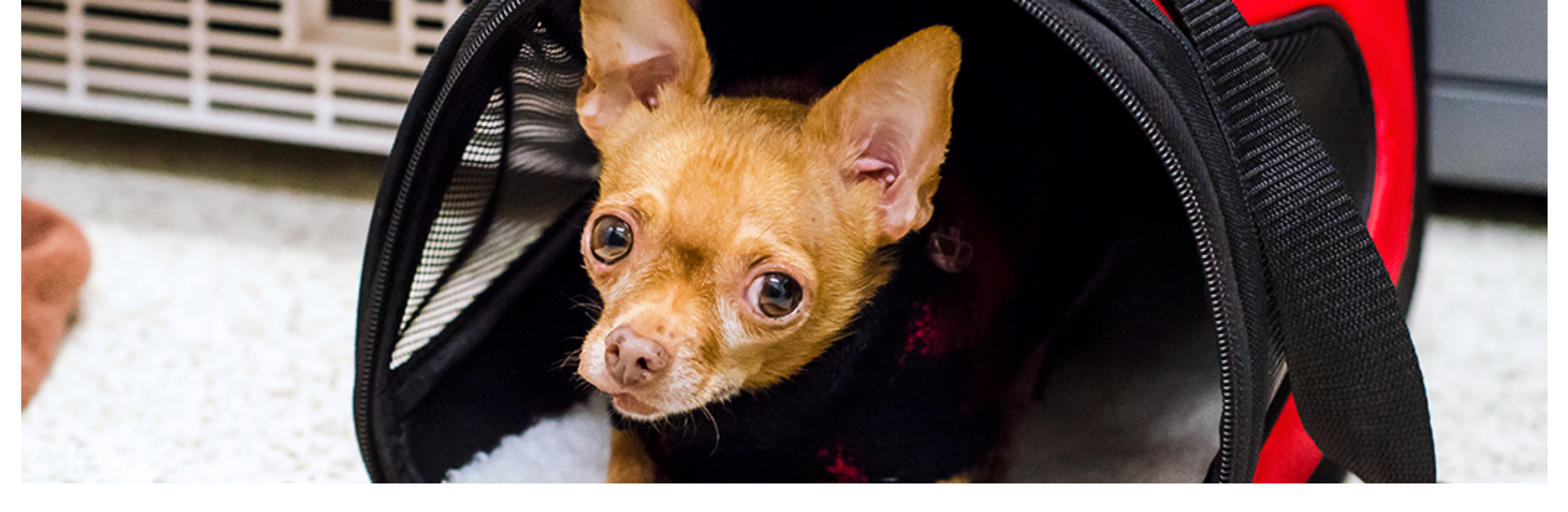
Step 4: Prepare Emergency Supplies and Traveling Kits

If you must evacuate your home in a crisis, plan for the worst-case scenario. Even if you think you may be gone for only a day, assume that you may not be allowed to return for several weeks. When recommendations for evacuation have been announced, follow the instructions of local and state officials. To minimize evacuation time, take these simple steps: